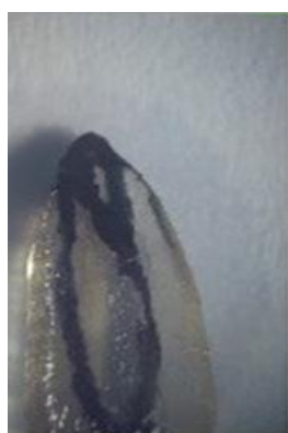
Figure 3. Lateral incisor with type XVIII of the Peiris's classification observed by the clearing technique (27)

Table 1 also presents the number of canals, presence of lateral canals, and presence of anastomosis and apical delta as determined by the CBCT and the clearing techniques.