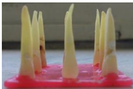
Figure 1. Samples prepared for CBCT

Italy). The buccolingual and mesiodistal deviation of the apical foramen from the anatomical apex was assessed in the coronal and sagittal planes, respectively. The number and type of canals (according to the Vertucci's classification) (26), presence of accessory canals, apical delta and anastomoses were determined by assessing serial axial views from the pulp chamber to the apex and also serial sagittal views obtained from the NNT Viewer. The morphology of the root apex was also assessed in the coronal and sagittal planes. The slice interval was 0.5 mm. All CBCT examinations and interpretations were performed by two calibrated researchers (a radiologist and an endodontist). In case of any disagreement, a consultation with another radiologist was done.