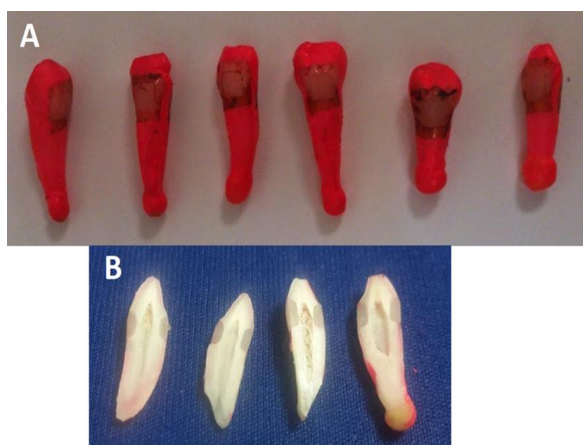
Figure 1. (A) Teeth removed from 0.5% fuchsin solution after 24 hours. (B) Samples were sagittally cut in half