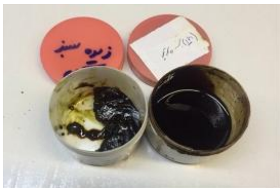
Figure 1. Aqueous and alcoholic extracts of cumin at 10% concentration

One-hundred grams of dried cumin was weighed using a digital scale and powdered using an electric mill. The powder was poured into an Erlenmeyer flask, and 1000 ml of distilled water was added to the powder which was warmed up in a heater for 10 minutes. The Becher cap was coated with aluminum foil for 40 hours. The suspension was filtered using a filter paper. An aqueous extract at 10% concentration was prepared using a water bath (Figure 1) [9].