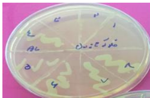
Figure 5. Evaluation of the minimum inhibitory concentration (MIC) of fluconazole against the growth of Candida albicans at concentrations of 200, 100, 50, 25, 12.5, 6.25, 3.125, and 1.56 mg/ml