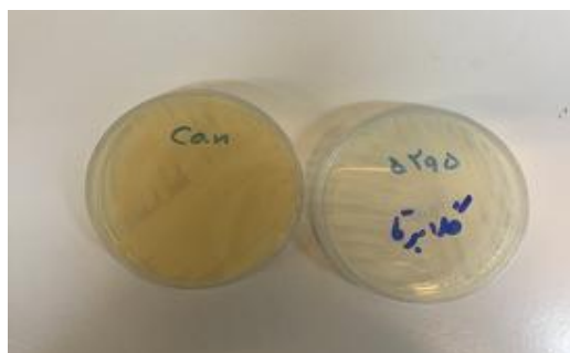
Figure 2. Candida albicans and Candida glabrata cultured on Mueller-Hinton agar

Mueller-Hinton agar was prepared at 37°C for 24 hours to culture Candida albicans and Candida glabrata . Fungal specimens were prepared in sterile physiological suspension serum. The 0.5 McFarland standard ( 1.5 \times 10^8 CFU/ml) was used to obtain uniform or homogeneous suspensions with similar concentrations of fungal specimens.