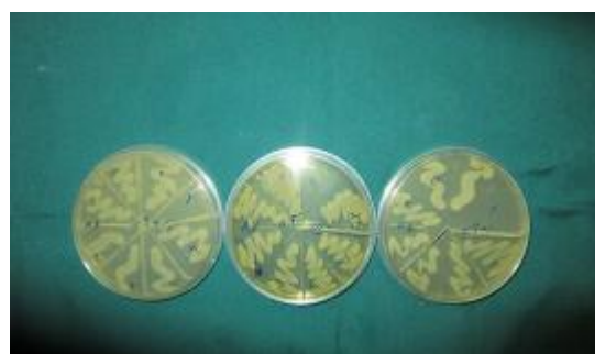
Figure 3. Evaluation of the minimum inhibitory concentration (MIC) of aqueous extract of cumin against the growth of Candida albicans at concentrations of 200, 100, 50, 25, 12.5, 6.25, 3.125, and 1.56 mg/ml in three phases of repetition of the experiment

and perform statistical tests between the groups.