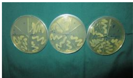
Figure 4. Evaluation of the minimum inhibitory concentration (MIC) of alcoholic extract of cumin against the growth of Candida albicans at concentrations of 200, 100, 50, 25, 12.5, 6.25, 3.125, and 1.56 mg/ml in three phases of repetition of the experiment