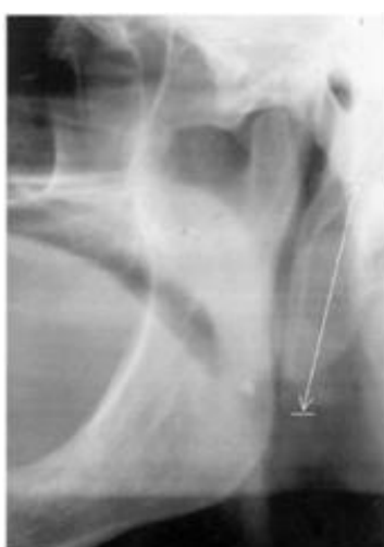
Figure 2. Measuring the length of styloid process