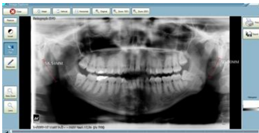
Figure 1. Dental Studio Plus software