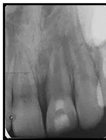
Figure 2. Postoperative radiograph

After approximately three weeks, the patient returned for examination. First, the tooth was evaluated for the presence of signs and symptoms, then based on the suitable conditions of the tooth, treatment was continued. Mepivacaine 3% (without a vasoconstrictor) was administered to anesthetize the tooth, followed by isolating it with a rubber dam. After preparing access cavity, the antibiotic paste was extracted from the canal using normal saline. Next, the canal was dried with the paper points. Intracanal bleeding was induced through over instrumentation by an endodontic file (#25). When bleeding was reached to CEJ region, MTA (white OrthoMTA; BioMTA, Korea) with 4 mm thickness was placed, then a resin-modified glass ionomer (Fuji II LC Restorative GI, Japan) was used to seal the area (Figure 2).