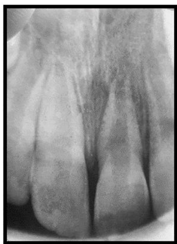
Figure 1. The initial periapical X-ray showing immature central incisor with the open apex and a radiolucent area in the apical region

An eight-year-old girl was referred to the Department of Pediatric Dentistry of Dental School of Dentistry, Tehran University of Medical Sciences for treatment of left maxillary central incisor. The chief complaint of the patient was a dental abscess which according to her parents had a three-month history. Clinical examination of the patient showed an uncomplicated crown fracture of #9 tooth without receiving any treatment during this period. Percussion test was normal, the score of tooth mobility was grade I, and the results of electric pulp test (EPT) and cold stimuli were negative. The fistula was observed in the buccal vestibule. Periapical radiography from the anterior maxilla showed immature teeth with open apex and thin dentinal walls in both maxillary incisors. A radiolucent area was also observed on apical region of tooth #9 (Figure 1). Clinical and radiographic evaluation pointed to pulp necrosis with a chronic apical abscess. Treatment plans of apexification and revascularization were explained to the patient's parents, and revascularization was chosen by them for treatment. The informed consent was obtained from patient's parents.