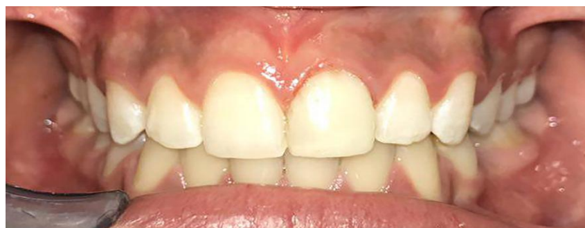
Figure 4. The follow-up photograph three years after revitalization