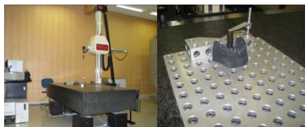
Figure 2: right: CMM, left: A cast fixed in the machine

Spatial coordinated of these points were measured by a Coordinate Measuring Machine (Mora, Aschaffenburg, Germany) with an accuracy of 10 \pm 0.01 micro-meters and digitally saved as. txt formatted files. (See fig.2). A curve fitting