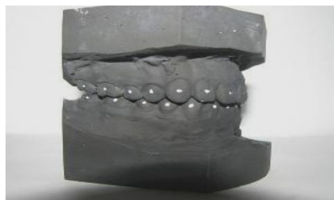
Figure 1: An orthodontic cast after painting and defining clinical bracket attachment points

placement guide for pre-adjusted appliances [19] (see fig.1)